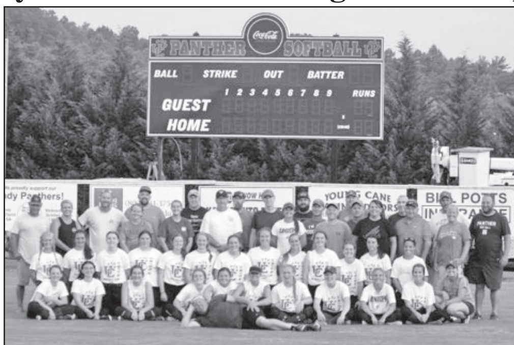
(Clockwise) Participants in the parents vs. players softball game. Union County softball players watch a movie and camp on the field at UCHS.

On Thursday, the Lady Panthers took part in another team-building exercise at Western Carolina Pacesetters in An-